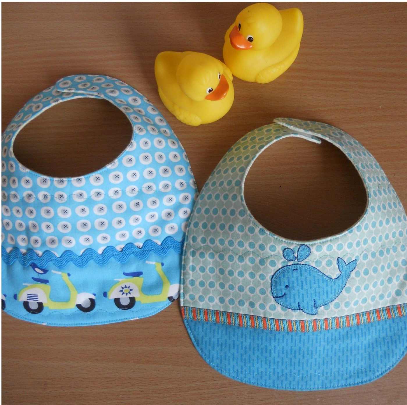
Finished! A cute bib or two.