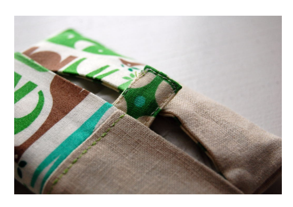
Now complete steps 1-5 as written.

Find a cute coordinating thread to do a line of topstitching on the linen 1/8" to the side of the seam.