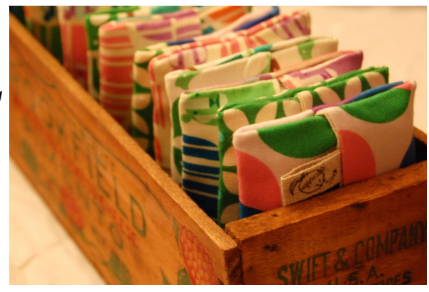
Pocket Tissue Pack © 2010 Jennifer Casa for Sew, Mama, Sew!