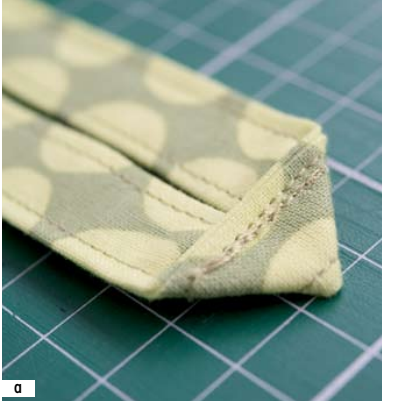
Fig a Flatten the tip at the bottom of the loop to form a neat triangle.

4 Interface the fabric pieces – match the fusible interfacing pattern pieces to their partner exterior pattern pieces and iron them to the WS of the fabric pieces. Select a main body exterior piece to be the bag front and iron one of the button reinforcement squares to the WS centre, 4cm (11/2in) down from the top edge. Repeat with the lining fabric pattern pieces, fusible fleece pattern pieces and button reinforcement square.