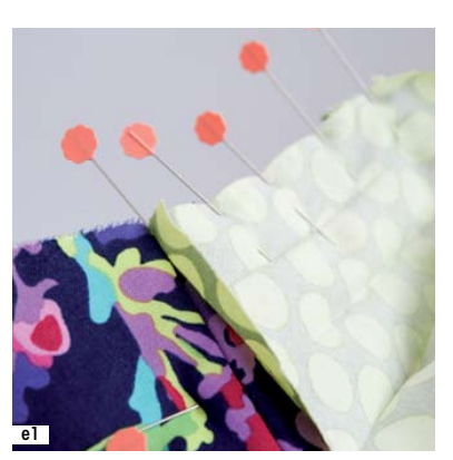
Fig e1 Begin pinning the binding to the top edge of the bag 5mm (% in) before the side seam.