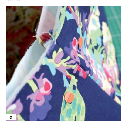
Fig c Carefully match the top edges and pin the lining and exterior bag together 4cm (11/2in) down from the top edge.