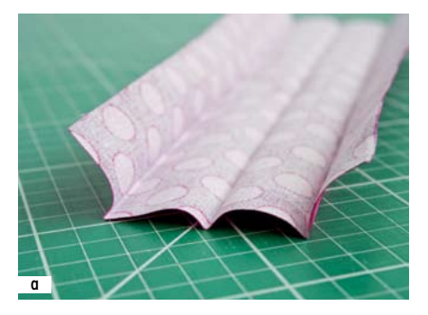
Fig a Fold the strip of fabric so that the folds look like a book jacket cover.

3Stitch the strap – take the folded strap, give it an iron and pin along the long open edge. Topstitch along both long edges of the strap. The strap is now complete and ready to sew onto your bag (see Need To Know).