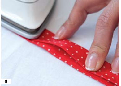
Fold and press the binding – take the pre-folded binding tape and press an off-centre crease across the length of the binding. See Fig a.

Fig a Fold the binding lengthways so that the bottom folded edge doesn't quite meet the top folded edge.