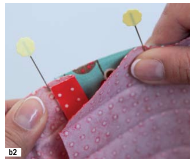
Fig b1-b2 Fold in the edge at the start of the binding before pinning. The end of the binding is trimmed long enough to overlap the start of the binding thus concealing the raw edge.