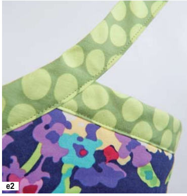
Fig e2 The topstitching along the side edge binding should flow smoothly into the bag handle. Topstitch again at the bag handle base to strengthen the stress area.

Right Have fun chopping and changing your tabric choices to make completely different looking bags. Try making a pelite version of this bag (see page 23) in deep coloured velvets and satins for a sweetly sophisticated evening bag. Or try inserting an easy-lo-make slip pocket onto the bag (see page 124). The time to do this would be between steps 4 and 5 (page 43).