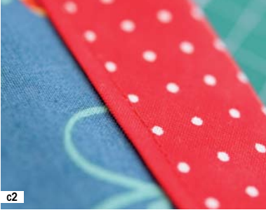
Fig c1-c2 The result from the front and from the back. Because the binding is taller at the back, the stitches from the front will easily catch the bottom edge of the binding at the back.